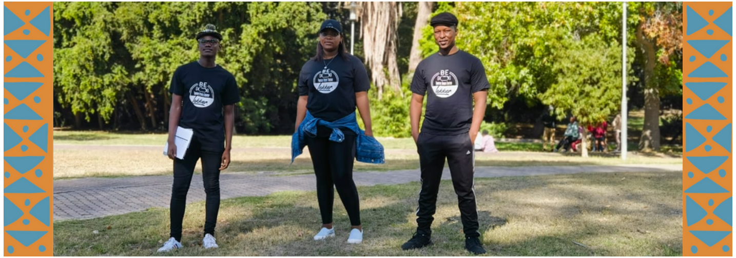
TRANSITION YOUTH LEARNERSHIPS