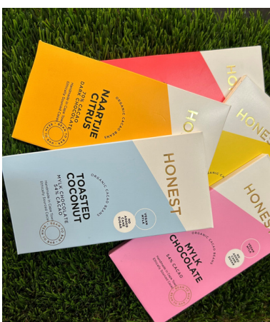
Thank you to Biogen, Blistex, Honest Chocolate and Ass Magic for your donations